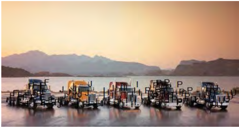
Fig. 4. Clustered keypoints by k -means algorithm

as ‘X’. Other keypoints are also misplaced, or they are detected on the background. Table 1 presents the comparison of both algorithms in the image description.