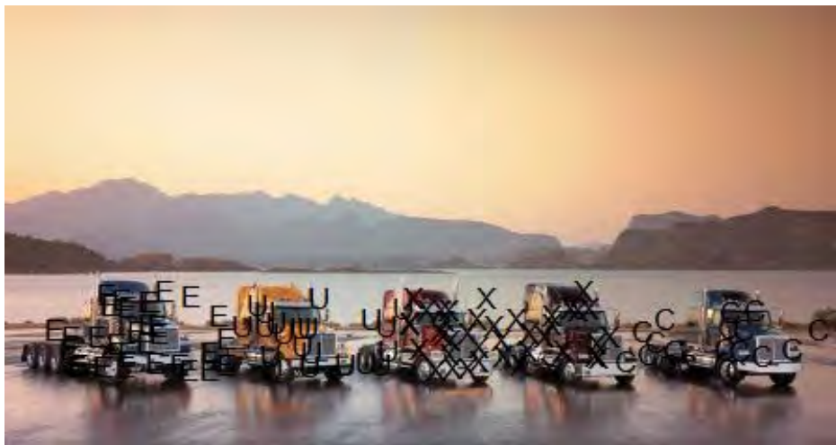
Fig. 5. Clustered keypoints by the mean shift algorithm