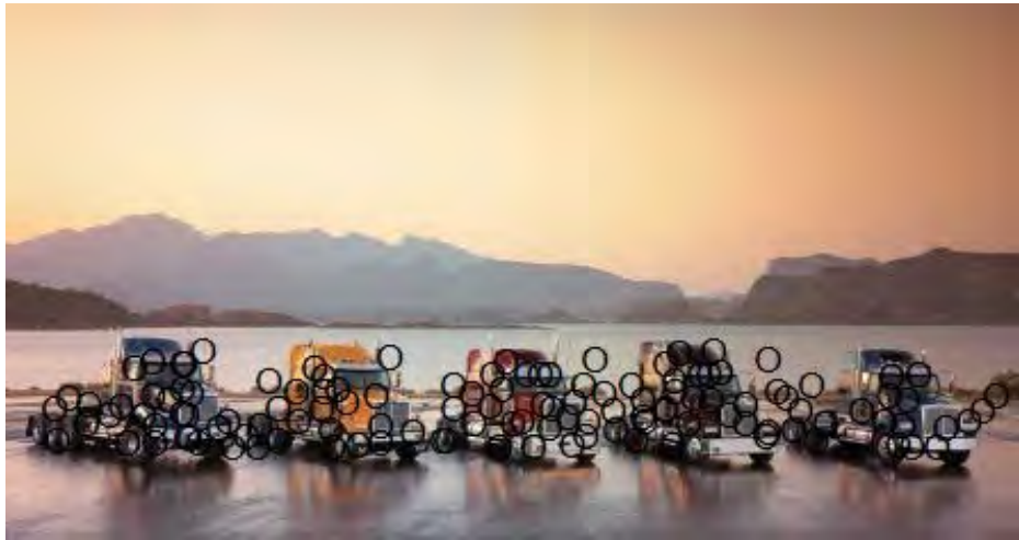
Fig. 3. Keypoints detected by the SURF algorithm. The circles represent the position of the keypoints

In this section we present the results of the experiments. The simulation environment was written by the author in .NET Framework with an Emgu CV library and C# programming language. The research includes experiments on various objects with a background. The system firstly detects all the keypoints in the input image (see Fig. 3) then the clustering algorithm can be chosen. Next, the clustering is performed. On the output we obtain the image with clustered keypoints. Clusters are labeled by ASCII characters (e.g. the first cluster is labeled by 'W', the second by 'c') as can be seen the characters are random, because our algorithm is flexible and we do not know how many clusters will be detected.